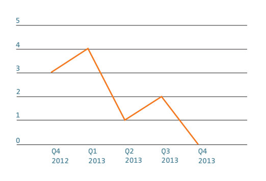
Figure 2: Average Inpatient Falls 2013 (Reported Quarterly)